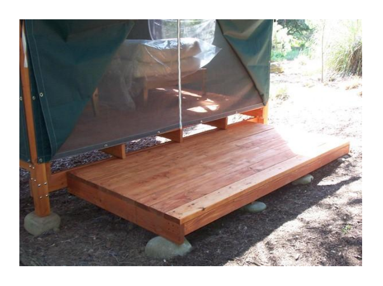
Tea Room with a custom "front porch" attached to the face of its Lower Floor Joist. (Also shows Zippered Entrance wall pinned open over a closed Zippered Screen wall, and a "Moon Window" wall behind one of the new twin beds inside.)