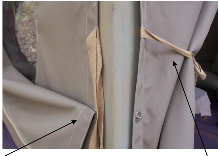
Pinned back with fastener

Detail of the fastener used to connect the fabric walls of a Tea Room to the structure. Slotted grommets fit over the stem of the fastener, which turns 90° to hold the wall. Two walls can be mounted on each side of the Tea Room , a marine fabric wall and a screen wall, to provide for maximum versatility.