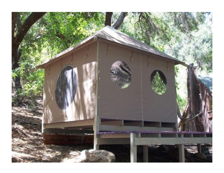
Tea Room with a "Moon Window" wall on the left, and a "Port Hole Window" wall on the right, with its central zipper down and the bottom of the wall secured to the edge of the main Tea Room deck. The custom color fabric is "Medium Beige."