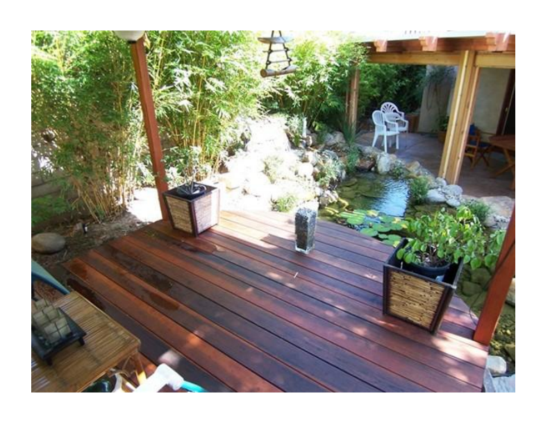
Tea Room with a custom deck made out of high quality 2x6 redwood floor boards, instead of the standard 2x6 Douglas fir planking. ( This example also features a round cantilevered extension beyond the typical 10' x 10' Tea Room deck.)