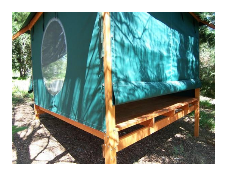
View on a Tea Room – the bottom edge of its Solid Wall has been turned up for added ventilation on a warm day. (With a "Moon Window" wall to the left, and two longer corner posts on the downhill side to accommodate the siting on sloped ground.)