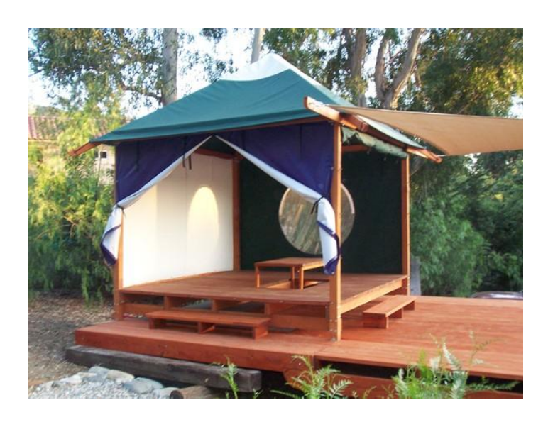
Tea Room with a Zippered Entrance wall (in"Plum") open + tied back, a solid white wall in the rear left, "Moon Window" wall rear right, and second "Moon Window" wall rolled up near right. (With shade sail, Kotatsu Table, step units + custom surround deck.)