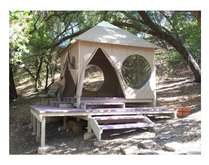
Tea Room sited on a hillside, with several custom features – custom color stains + fabric, surround deck, retaining wall, stairs + step units. (On the near side, a wall with an offset "Moon Window" and a zippered entrance.)