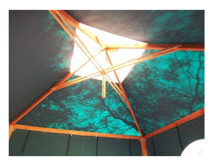
Central "skylights" are standard on all marine fabric roofs for the Tea Room . The "Ivory" fabric at the peak of the pyramid-shaped roof admits a gentle glow that fills the whole interior with soft light.