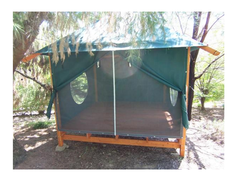
Tea Room with a Zippered Entrance wall open + tied back, and a Zippered Screen Entrance wall in its down position, with the bottom of the wall secured to the edge of the deck. (With "Moon Window" walls on the left and right, and a solid wall to the rear.)