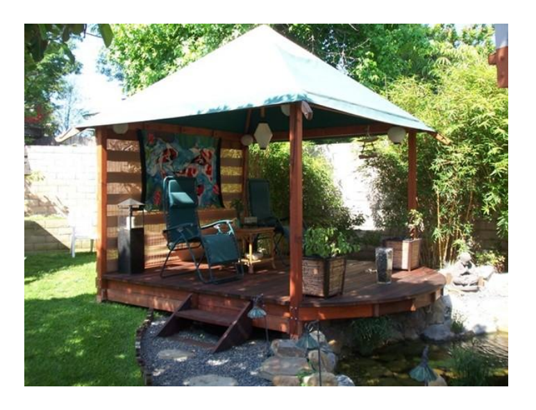
Another view on a Tea Room with a custom deck made out of high quality redwood floor boards and a cantilevered extension over a koi pond. In as similar manner, with the addition of custom floor joists, the standard 10' x 10' deck of the Tea Room can be extended on any one or more of its four sides.